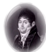
Commodore Isaac Hull

The Commodore Hull Thanksgiving Day 5k Road Race was started in 2002 by a small committee of volunteers who wanted to create a community event that would recognize one of the greatest naval heroes in U.S. history, Commodore Isaac Hull, and bring attention to the tremendous changes going on in the downtown areas of the two communities of Shelton and Derby.